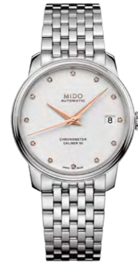
69 - M027.208.11.036.00 CHRONOMETER - CALIBER 80

Clean lines and cutting-edge technology for a timepiece combining elegance and accuracy. The Baroncelli Chronometer Silicon models feature a sumptuous dial with a slate-inspired pattern.