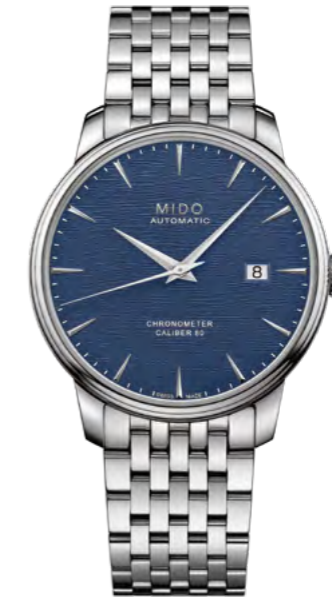
70 - M027.408.11.041.00 CHRONOMETER - CALIBER 80