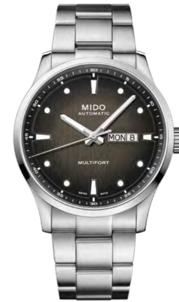
19 - M038.430.11.051.00 CALIBER 80