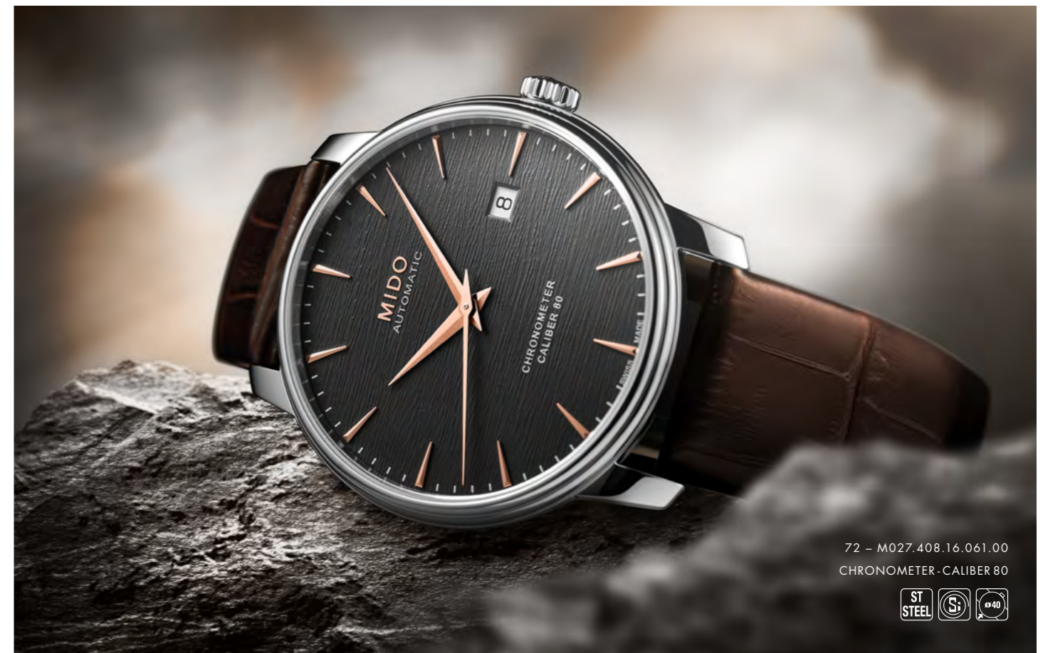
72 - M027.408.16.061.00 CHRONOMETER - CALIBER 80

THE EPITOME OF A CLASSIC, THE TIMELESS BARONCELLI HAS EMBODIED THE ULTIMATE IN AESTHETIC REFINEMENT SINCE 1976. MIDO HAS DESIGNED THIS COLLECTION TO BE SOPHISTICATED AND HARMONIOUS IN EVERY TINY DETAIL.