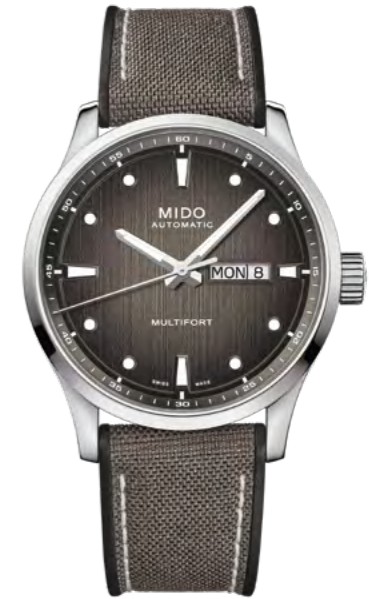
20 - M038.430.17.081.00 CALIBER 80