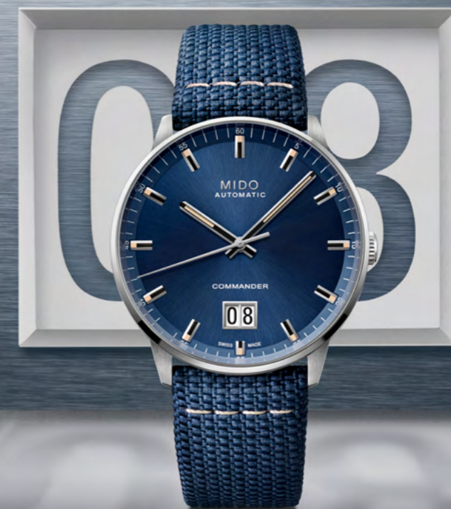
59 – M021.626.17.041.00 CALIBER 80