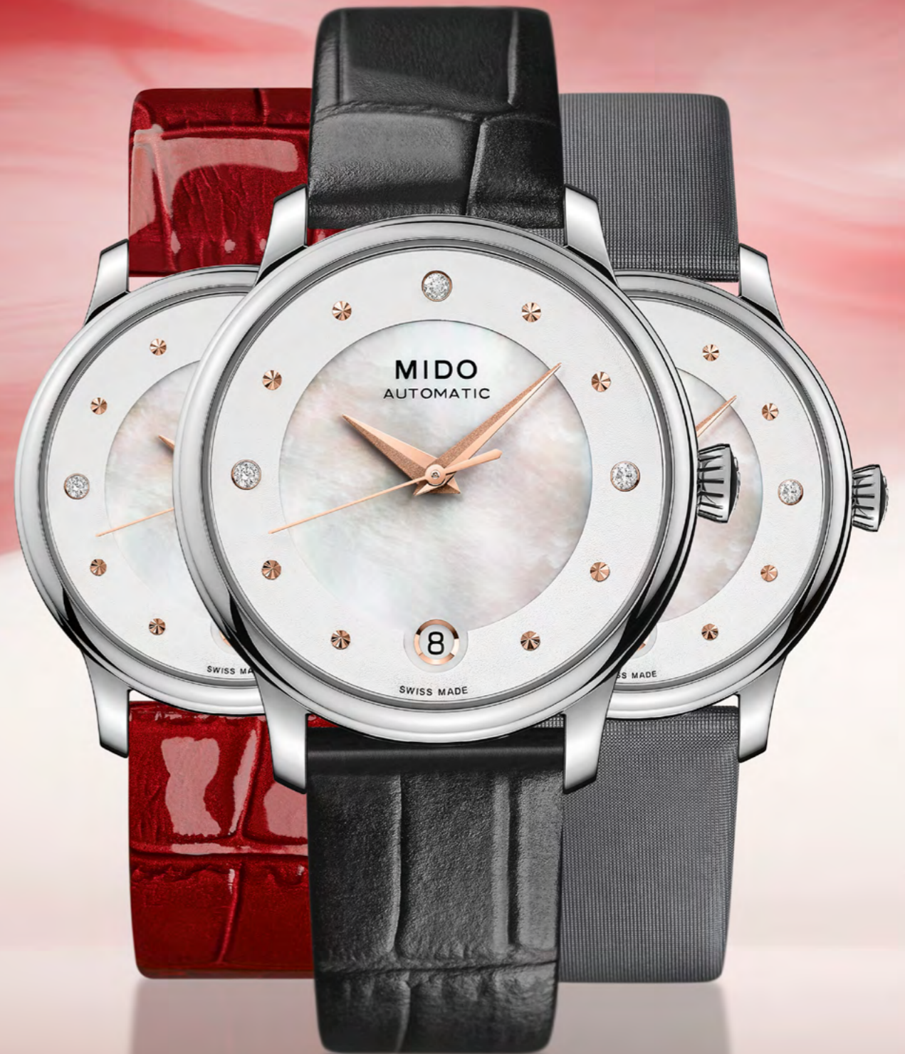
95 - M039.207.16.106.00 CALIBER 80

SPECIAL EDITION WITH 3 INTERCHANGEABLE STRAPS