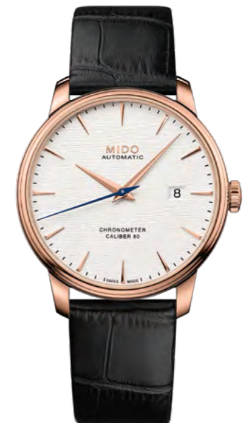
71 - M027.408.36.031.00 CHRONOMETER - CALIBER 80