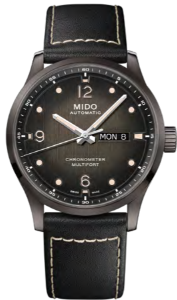
23 - M038.431.36.057.00 CHRONOMETER - CALIBER 80