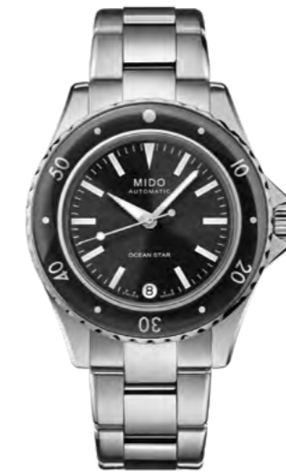
2 - M026.207.11.051.00 CALIBER 80