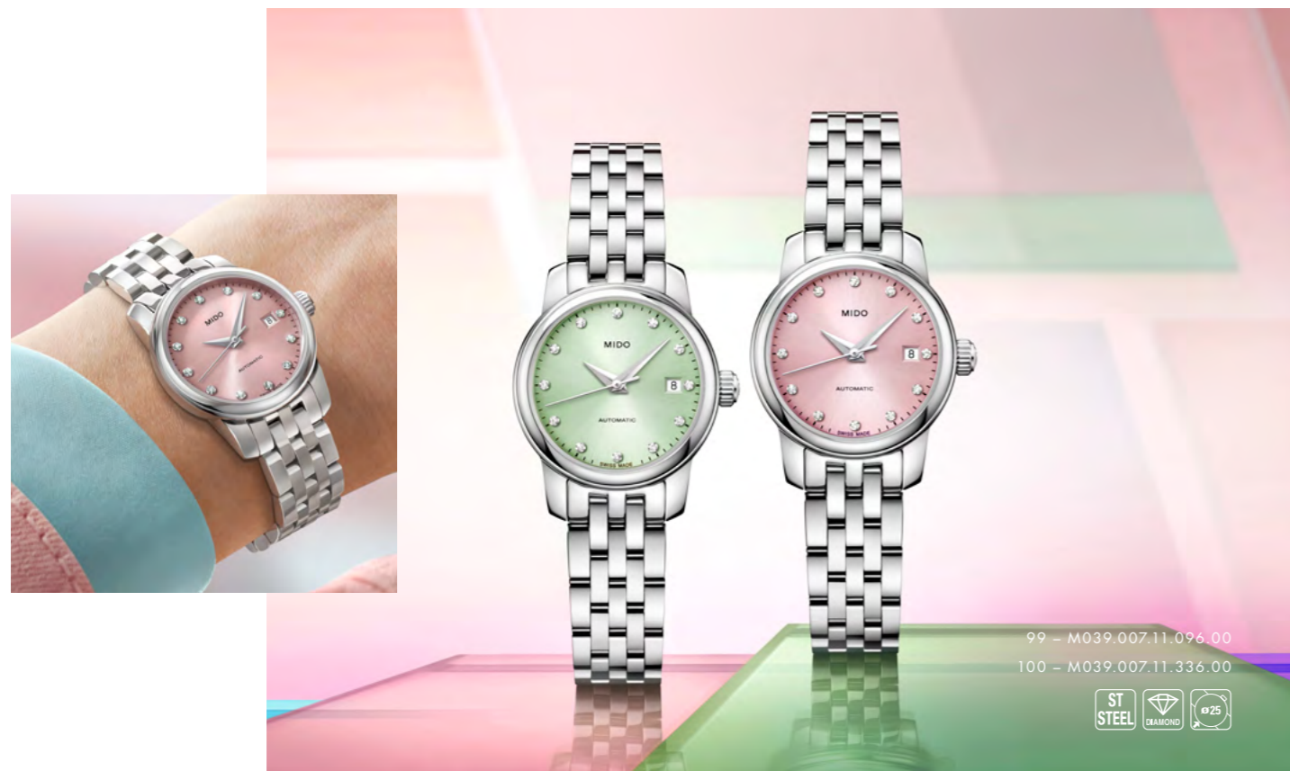
99 – M039.007.11.096.00