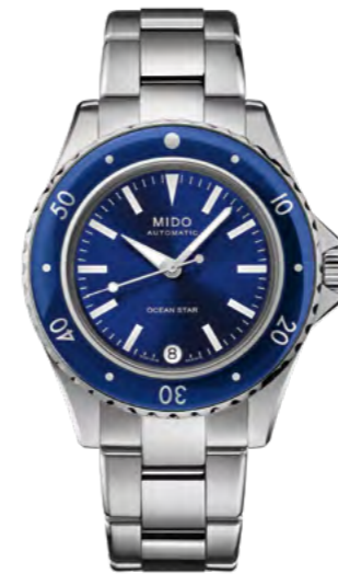
1 - M026.207.11.041.00 CALIBER 80

MIDO presents the captivating Ocean Star 36.5 with a new diameter to fit any wrist. This sixties-inspired diver's watch – a sporty yet chic model – has been designed for intrepid explorers and the most elegant sun-worshippers alike.