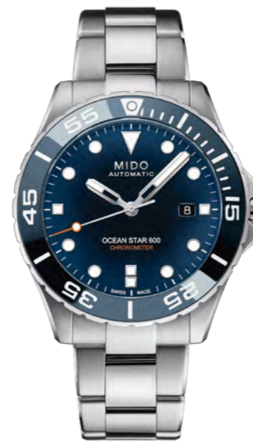
16 - M026.608.11.041.01 CHRONOMETER - CALIBER 80

SPECIAL EDITION WITH INTERCHANGEABLE RUBBER STRAP