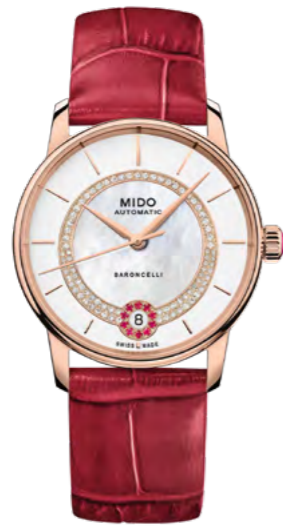
92 - M037.807.36.031.01 CALIBER 80