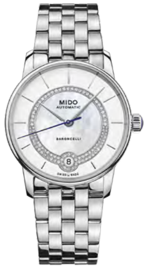
91 - M037.807.11.031.00 CALIBER 80

Feminine, elegant and exclusive: each model combines timeless design and attention to detail.