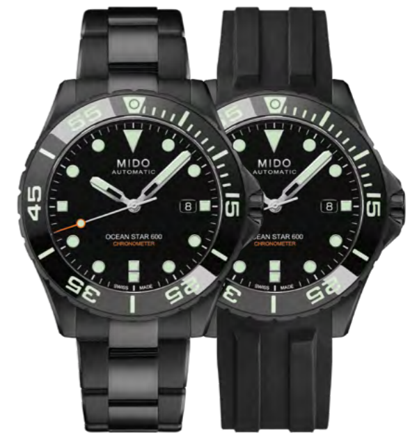
17 - M026.608.33.051.00 CHRONOMETER - CALIBER 80