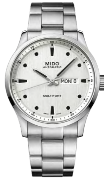
18 - M038.430.11.031.00 CALIBER 80

MIDO has given the powerful aesthetic of the Multifort fresh momentum by introducing an original vertical satin-finished dial. A bold look that is masterfully paired with a robust, high-tech mechanism.