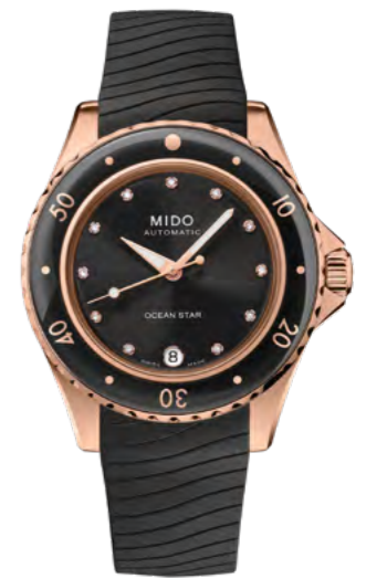
3 - M026.207.37.056.00 CALIBER 80