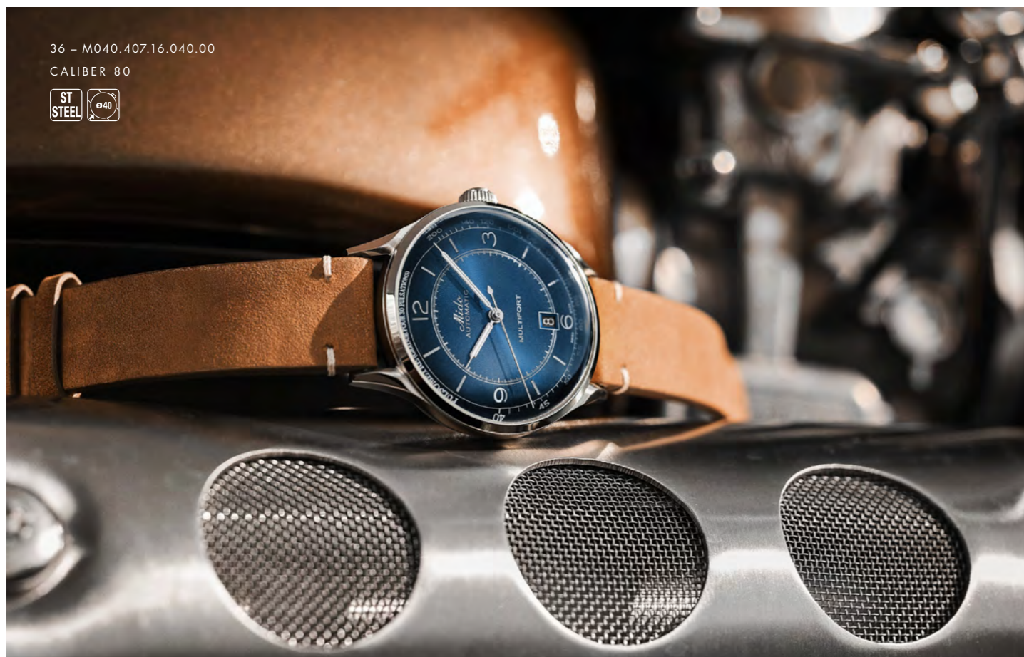
36 - M040.407.16.040.00