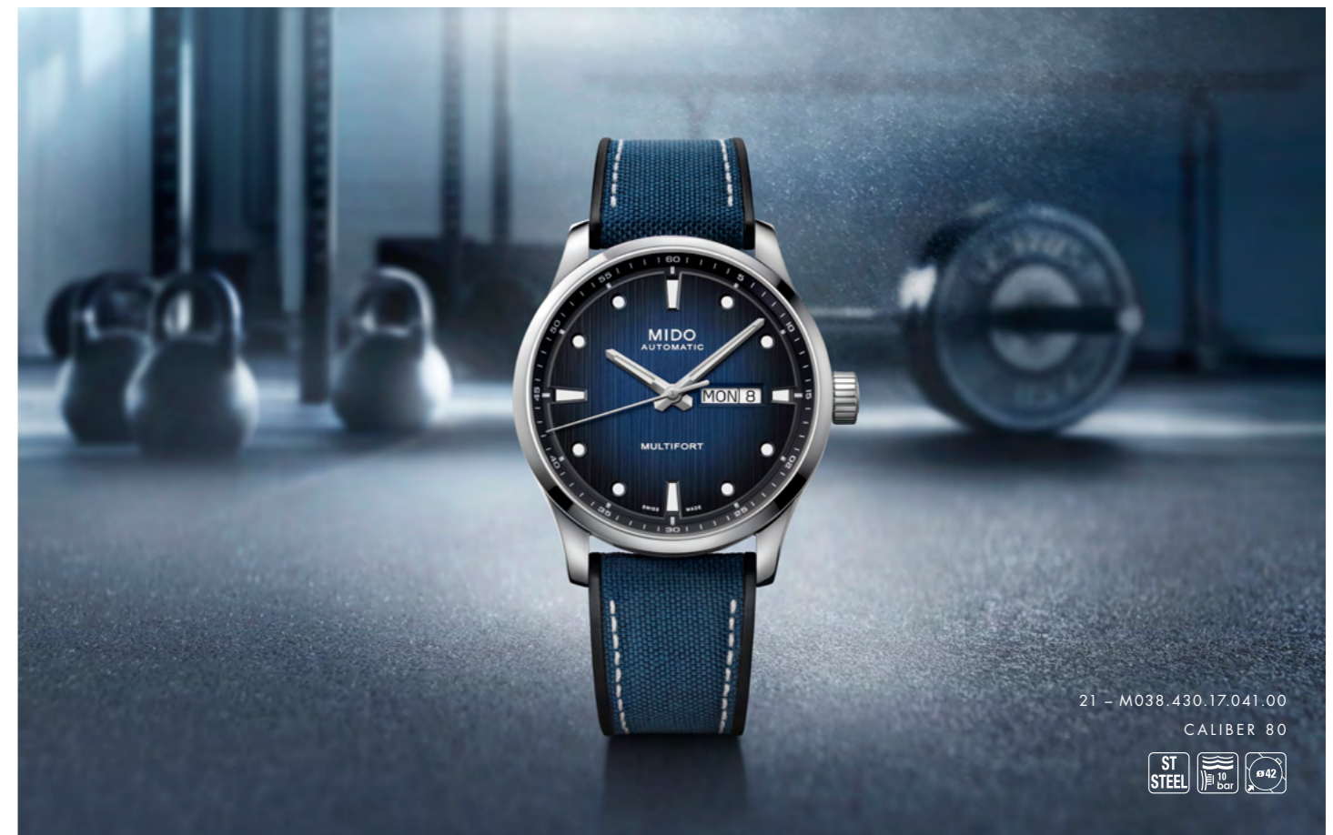
21 - M038.430.17.041.00 CALIBER 80