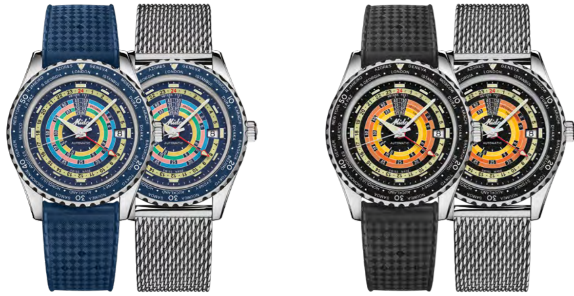
4 - M026.829.17.041.00 CALIBER 80

SPECIAL EDITIONS WITH INTERCHANGEABLE STRAP