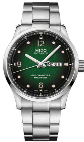
22 - M038.431.11.097.00 CHRONOMETER - CALIBER 80

The perfect expression of its watchmaking mastery, MIDO presents the Multifort M Chronometer with a silicon balance-spring movement, tested and certified by the COSC (Contrôle Officiel Suisse des Chronomètres – Official Swiss Chronometer Testing Institute). This model is distinguished by its exceptional quality, which far exceeds the usual standards.