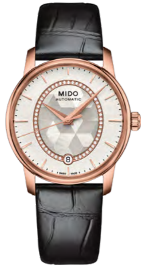
93 - M007.207.36.116.00 CALIBER 80